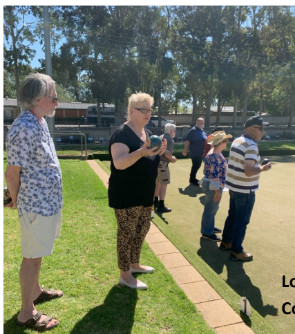
Locals enjoying Come and Try Day