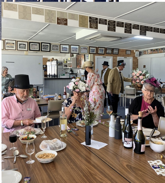
Probus members checking the form guide for Melbourne Cup.