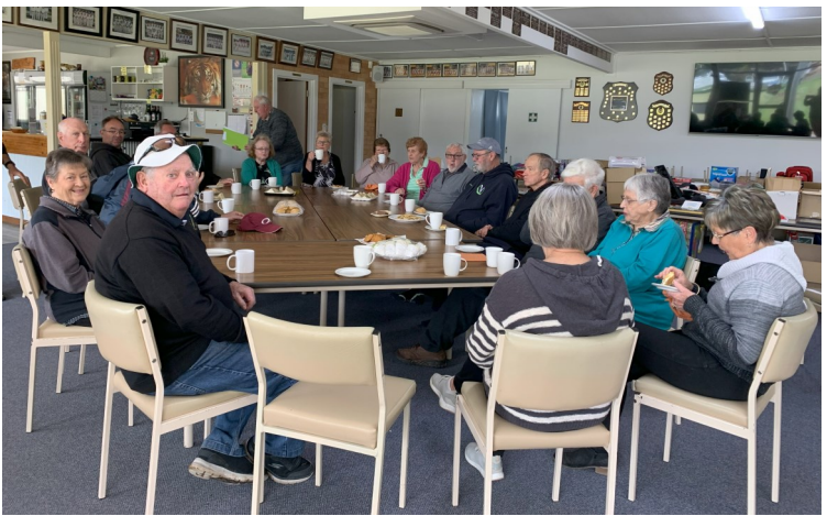
Cupboards were cleaned out, garage sale items sorted and displayed, line marking underway and it was time to have morning tea.